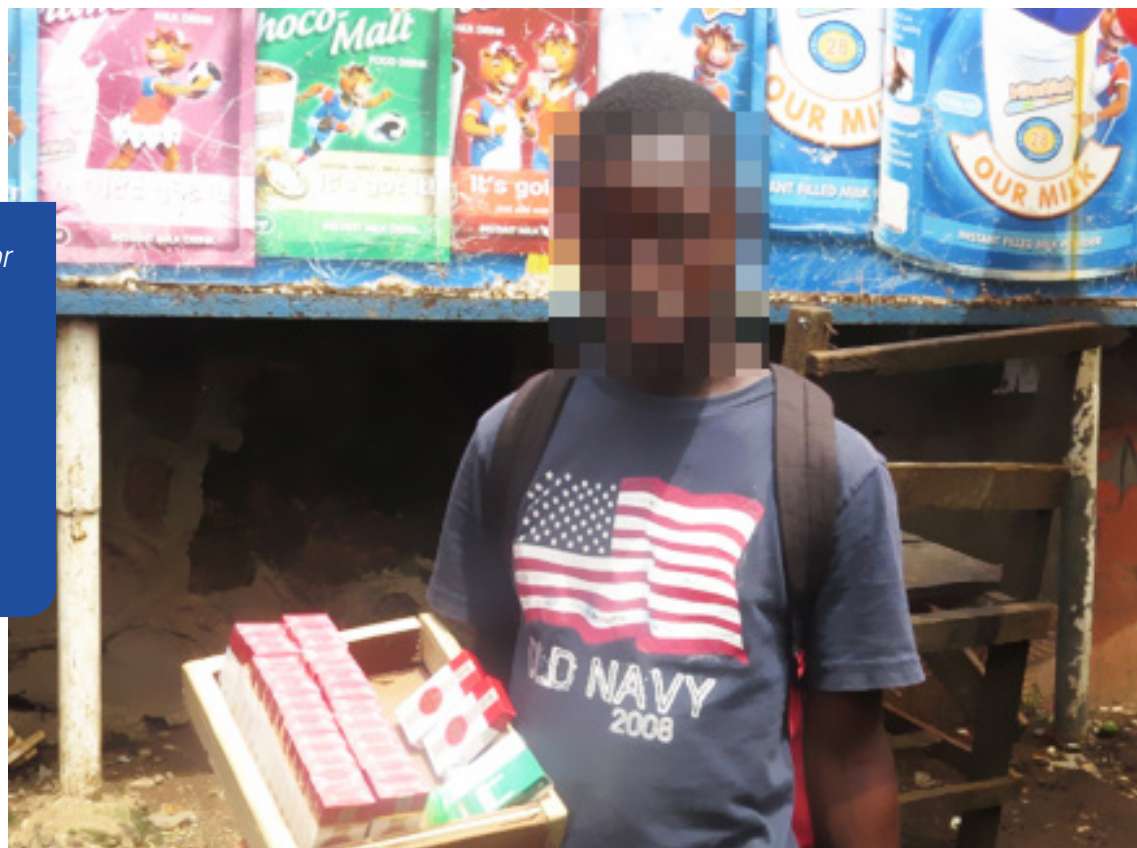
A mobile vendor of cigarettes near Dr. SM Broderic Municipal Secondary School - Benjamin Lane, Freetown.