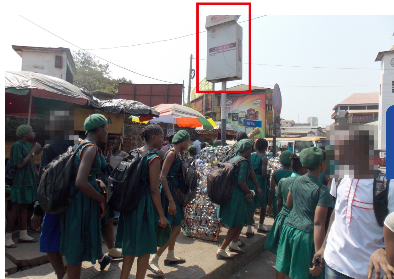
Cigarette advertising near Annie Walsh School, Kissy Road

One store displayed cigarettes with non-tobacco products.