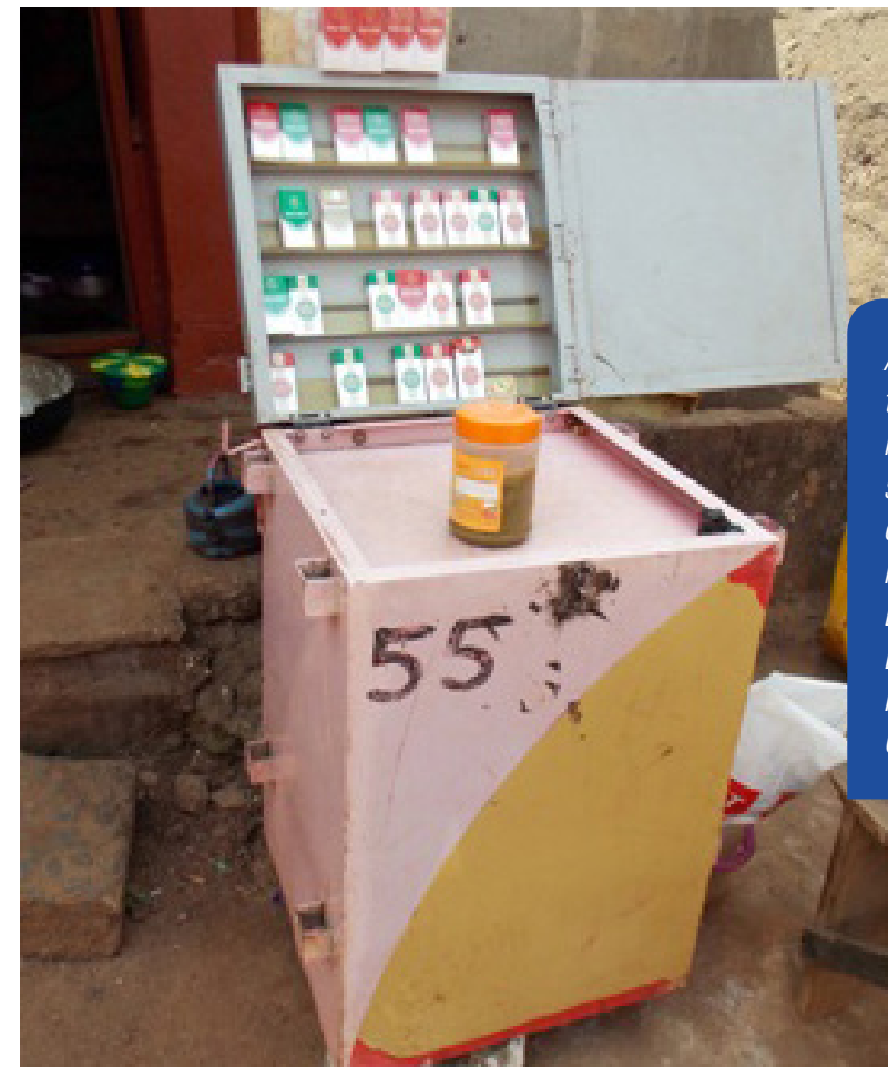
A stand in a temporary kiosk selling single sticks of cigarettes near Sierra Leone Muslim Brotherhood Primary school, Calaba town.

100% of schools surveyed had stores and other outlets like mobile vendors and kiosks around them selling packs of less than 20 cigarettes.