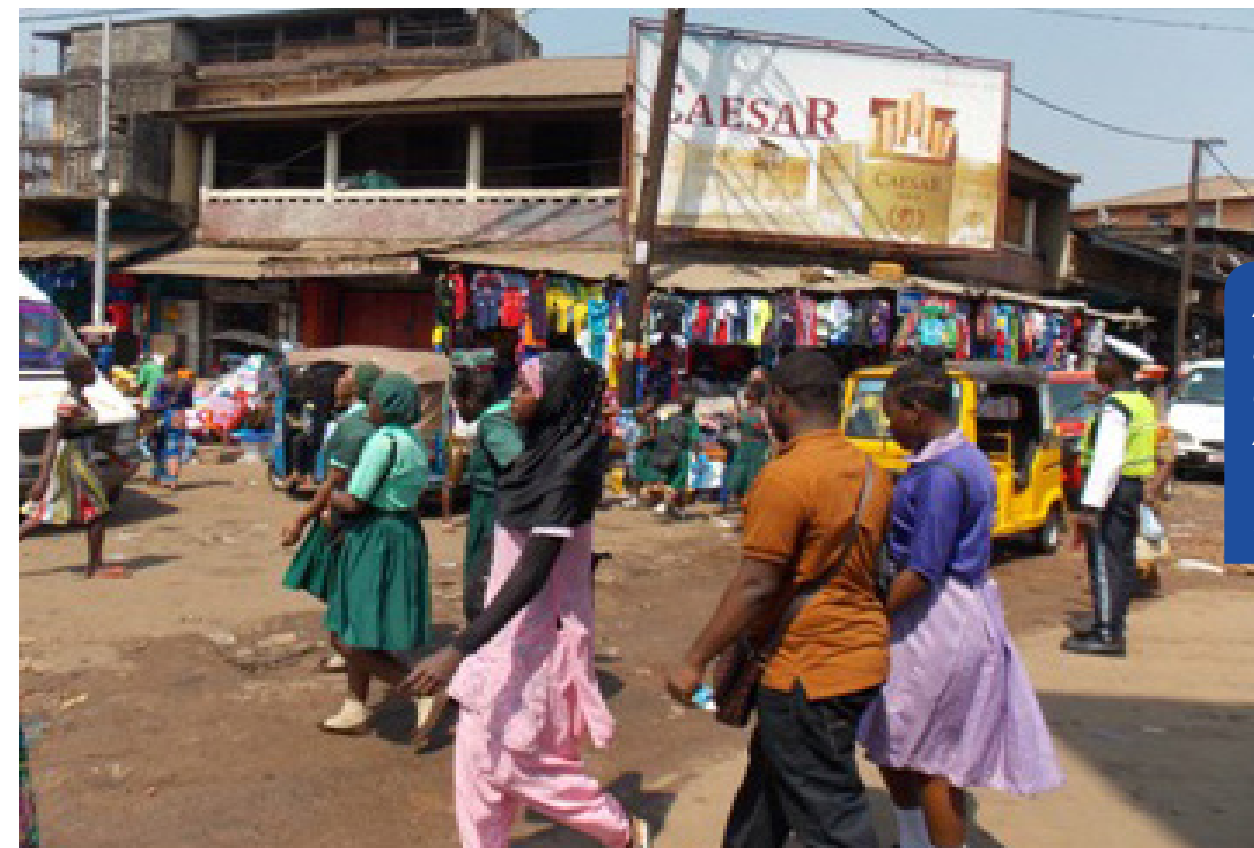
A billboard advertising a cigarette brand near Annie Walsh Girls Secondary School - Kissi Road.

Advertising through umbrellas bearing the colours and brand of tobacco products, installed by temporary vendors, was also carried out. A total of 5 umbrellas were seen around 4 of the 23 schools observed.