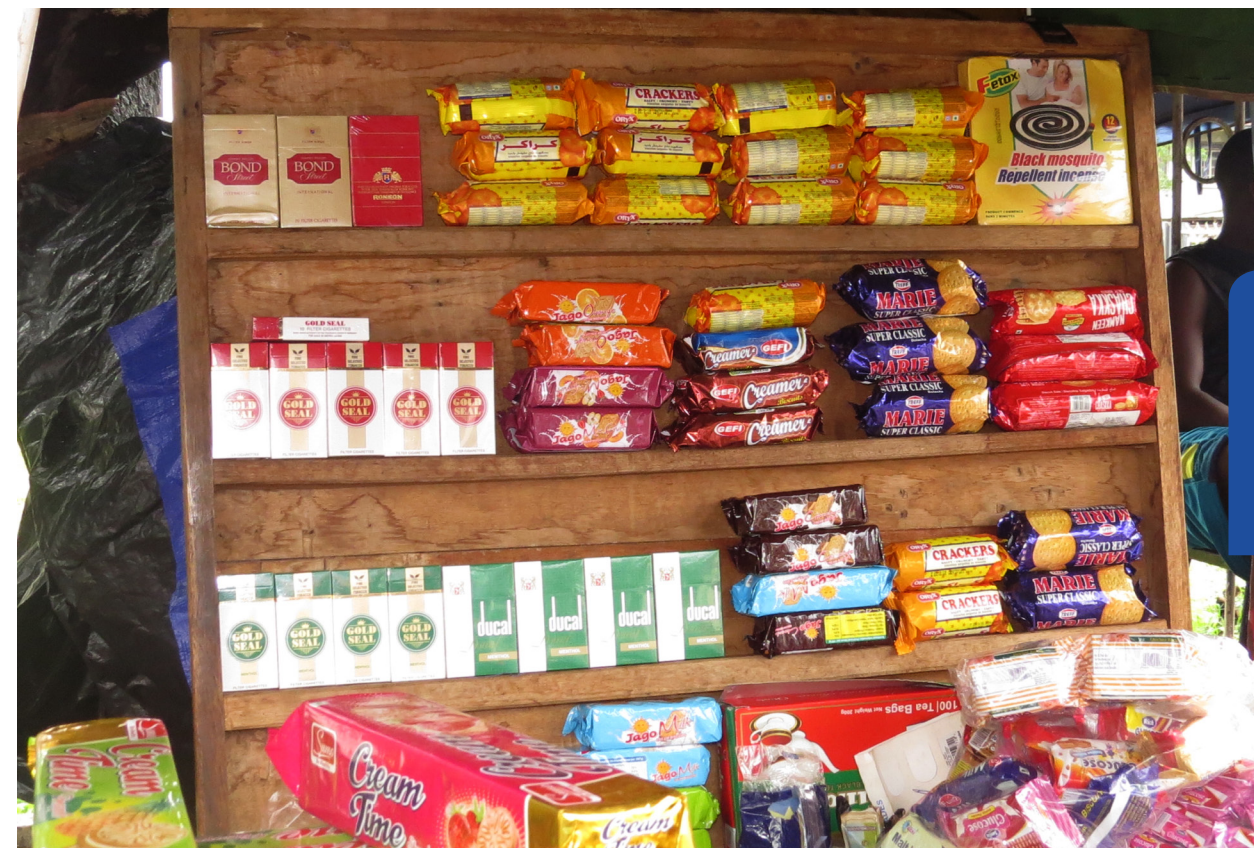
A display rack in a temporary kiosk near Modern High School, off Jomo Kenyatta Road.

82% of the schools surveyed (19 out of 23) had a total of 38 convenience stores/groceries selling tobacco products around them.