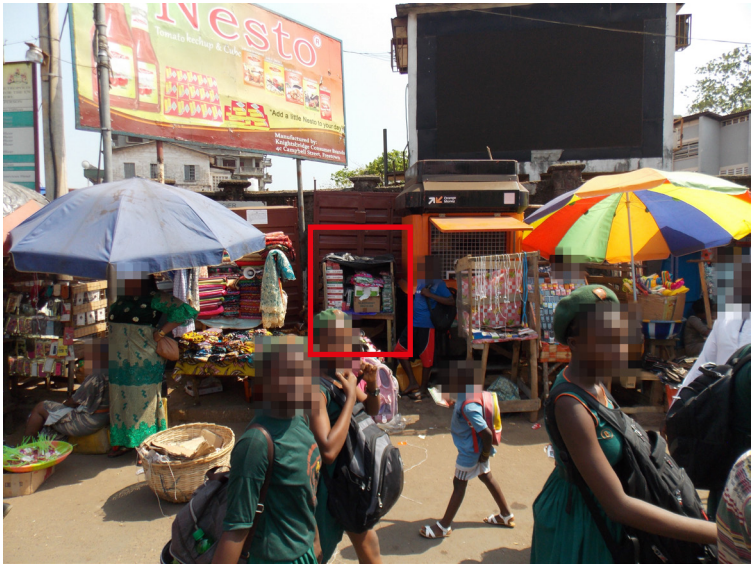
A temporary kiosk without a “No sale to minors” sign, close to the gate of Annie Walsh School, Kissy Road.