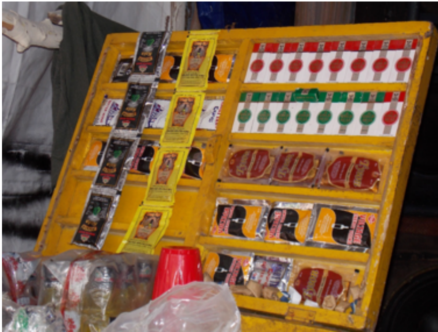
A point of sale without “No sale to minors” sign selling tobacco products and non-tobacco products liked by children near Dr. SM Broderic Municipal Secondary School - Benjamin Lane, Freetown

Of the 146 points of sale found around the 23 schools surveyed, only one displayed a “No sale to minors” sign.